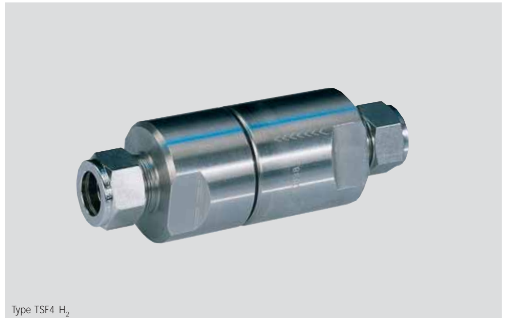
Type TSF4 H 2